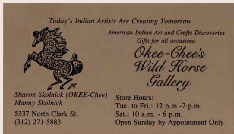
Fig. 6.4 Wild Horse Gallery business card. Collection of Nora Moore Lloyd.

The American Indian Economic Development Association (AIEDA) was formed in 1985 with a mission to promote economic development within the Chicago Native community. This Native-run organization focused on advocacy and programming for Chicago’s urban Native population. By 1990, the AIEDA determined that Native Americans were underrepresented in museums and galleries and saw the economic benefit of creating more opportunities in arts and cultural institutions. To that end, it formed a subcommittee focused on creating a Native American cultural center in Chicago, seeking to “establish a Chicago-based institution which would serve as a