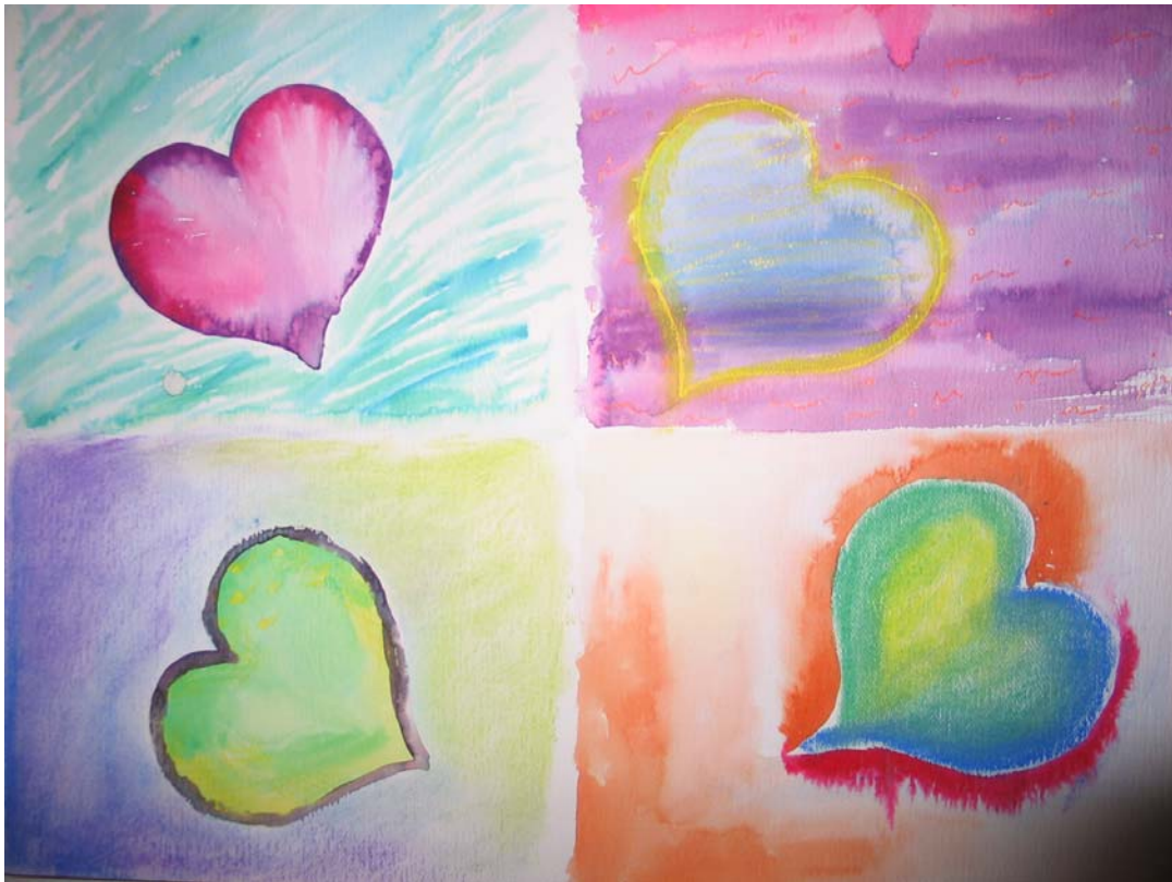
Completed work from Exploring Series and Media lesson plan