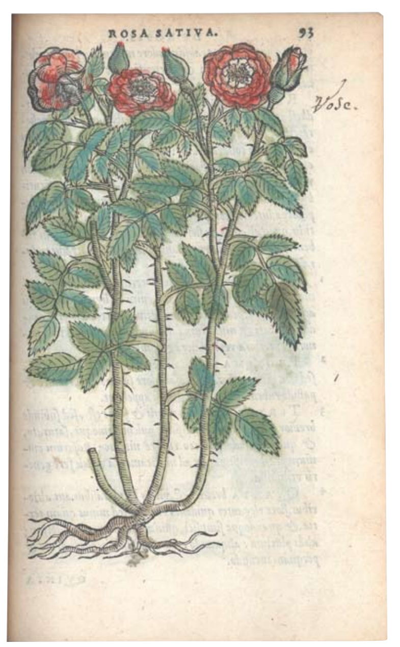
Rembert Dodoens and Pieter van der Borcht I, Rosa sativa, from History of flowers and several kinds of plants used for fragrant garlands, Antwerp Christopher Plantin, 1568, book with hand-colored woodcuts. Library of the Arnold Arboretum, Harvard University, Ka D66f 1568 c.2 (1).

The Block's winter exhibition reconsiders the role of art in scientific investigations of the 16th century, challenging the perception that artists were mere illustrators in the service of scientists and demonstrating art's function as both research instrument and agent of knowledge dissemination.